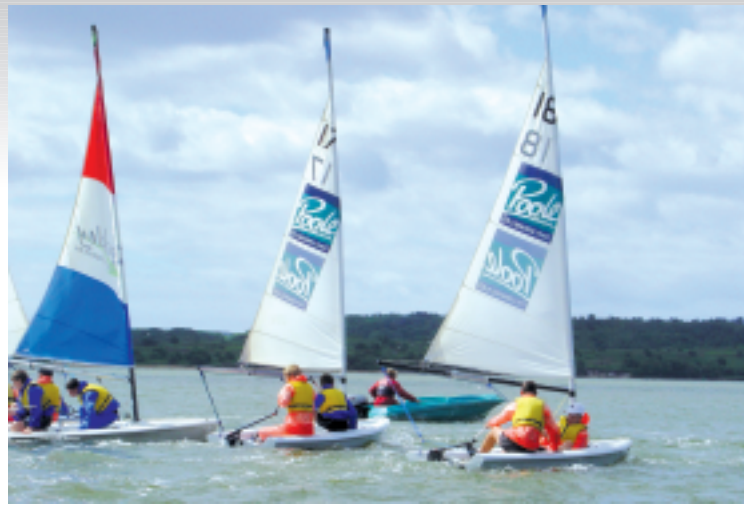
Year 8 Leavers' Trip, Poole Harbour 2004