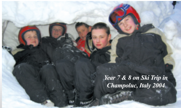
Year 7 & 8 on Ski Trip in Champoluc, Italy 2004