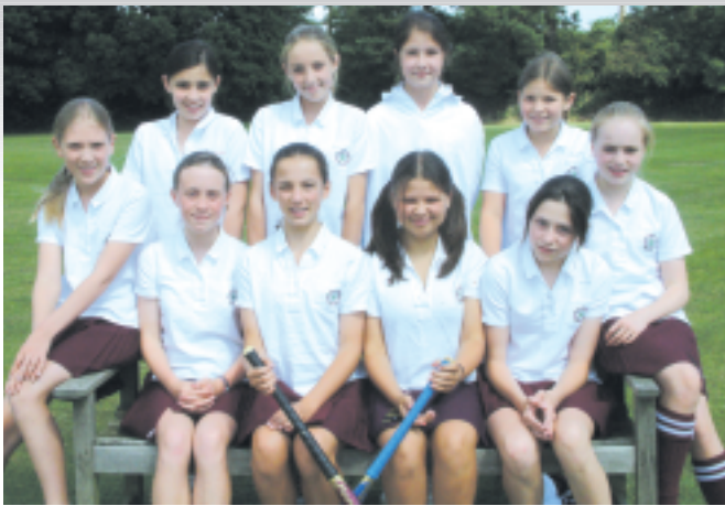
U13 XI Hockey Squad 2004