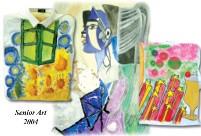
Senior Art 2004