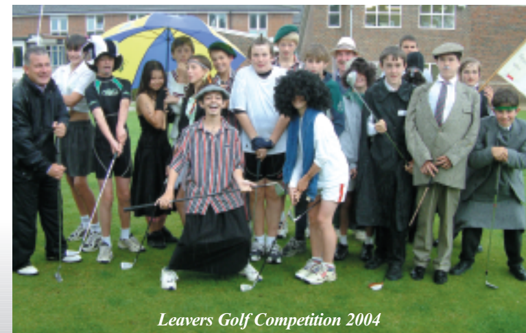
Leavers Golf Competition 2004