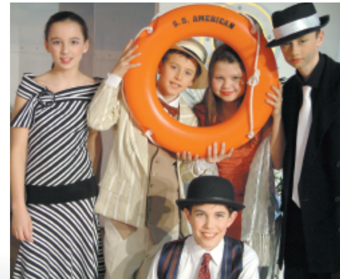
Anything Goes – School Production 2004

The top two years at Rose Hill provide a bridge between primary and secondary education and great opportunities for personal and academic development. Children can take on roles and responsibilities which do not normally happen in a secondary school until a child reaches the sixth form.